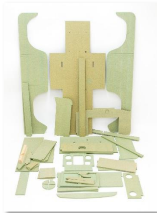
Example panel set