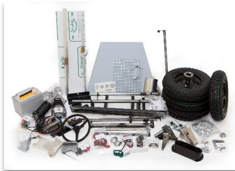
Example basic kit

The basic kit contains all the metal work, 1 motor and battery, wheels, lights, windscreen, bonnet and all electrical components needed to build a Toylander (see website for basic kit components for each model). You will need to provide your own wood (12mm thick marine ply or moisture resistant MDF) for the body panels, softwood batten to assemble the panels into the body tub, glues, fixings and paint. The manual contains all the dimensions and instructions that you will use to mark out, cut and assemble the panels to complete the body tub and fit bonnet ribs into the supplied cut and shaped aluminium bonnet skin.